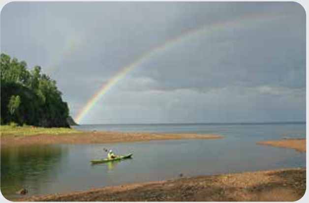
Lake conditions can change quickly.

A paddler must be prepared to deal with conditions and have the paddling skills needed to ensure their safety. Local marine weather forecasts should be monitored before and during any trip on the lake. You should understand how these forecasts can help predict lake conditions. Wave heights can be greatly increased by shoreline features and currents.