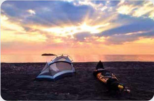
Explore camping opportunities along this segment.

Be prepared to deal with conditions and have the paddling skills needed to ensure your safety. Local marine weather forecasts should be monitored before and during any trip on the lake. You should understand how these forecasts can help predict lake conditions. Wave heights can be greatly increased by shoreline features and currents.