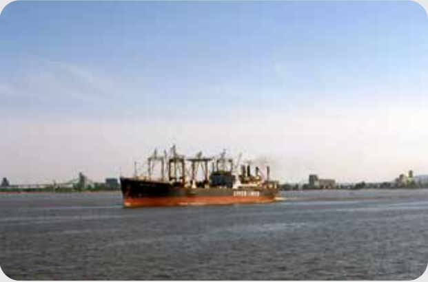
Make sure you know the nautical rules of the road.

Shipwrecks are tragic reminders of Lake Superior's power, something that no paddler should underestimate. Lake cliffs can be serious hazards to the unwary. Calm summer waters can change to life-threatening conditions in minutes and cliff areas can prevent you from seeking safety on shore. A paddler must be prepared to deal with conditions and have the paddling skills needed to ensure their safety. Local marine weather forecasts should be monitored before and during any trip on the lake. You should understand how these forecasts can help predict lake conditions. Wave heights can be greatly increased by shoreline features and currents.